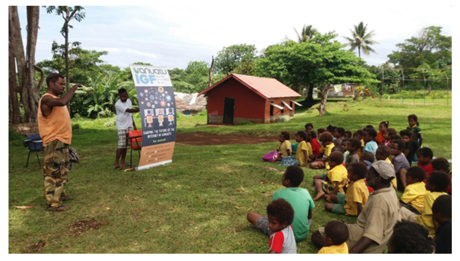
Picture: Vanuatu IGF works with our schools to talk about internet safety, students at Ecole Primarie de Itaku, South Tanna

We have been out into schools and villages and we can now see for ourselves that we accept that change is constant. It is the extent to which we care about the direction of social change that we can try to shape it and help to create the kind of "change we wish to see in Vanuatu